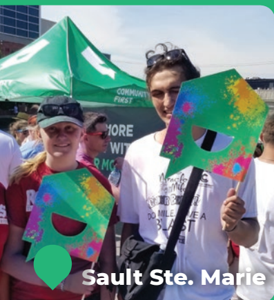
Sault Ste. Marie